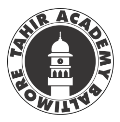
Home of Atfal and Nasirat

Tahir Academy Baltimore Handbook 2015-2016